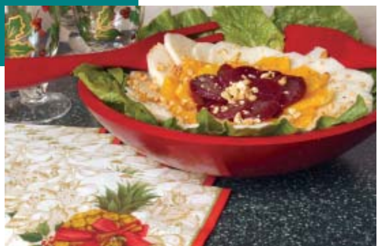
Salad bowl, tongs and napkins courtesy of the Hartford Hospital Auxiliary Gift Shop.

This recipe calls for jicama , unfamiliar to many but growing in popularity in the United States because of its unique crisp texture and low calorie content. Jicama is a tuber popular throughout many countries in Latin America and Asia. In Mexico, it is traditionally eaten as a snack and often sold on street corners or in fresh air markets, peeled and sliced raw with lime juice and a bit of cayenne pepper. Cut into squares it adds a satisfying crunch to fruit salads. However you eat your jicama, at 45 calories per cup and virtually fat-free, it is definitely worth a try!